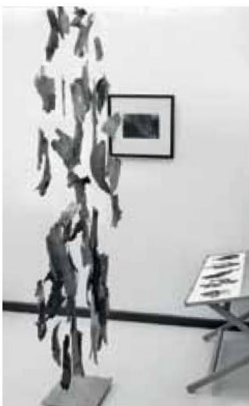
Harvey Mullen Ghost Gum, site specific installation, 2017 harveymullen.com